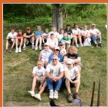
Sunset Gap Tennessee